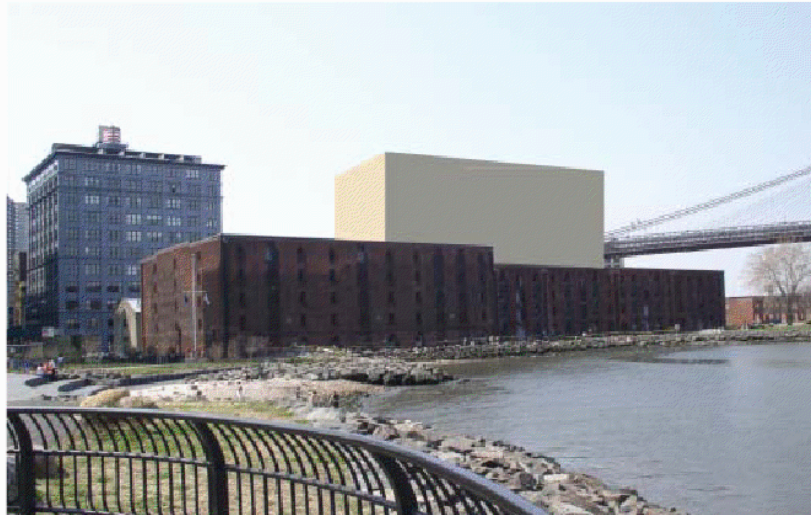
BROOKLYN BRIDGE PARK VIEW AFTER