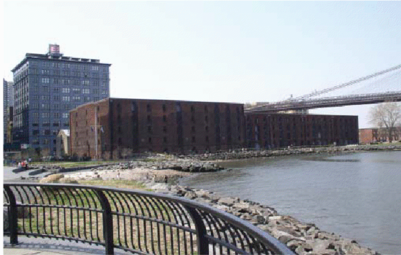
BROOKLYN BRIDGE PARK VIEW BEFORE