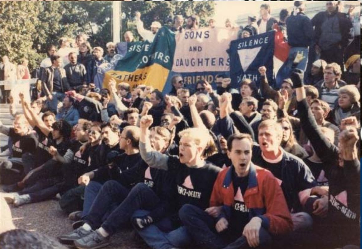
hundreds of members of ACT UP protest for more AIDS funding during terminal. (Story on Page 37.)